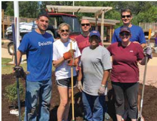
Volunteers from Deloitte help spruce up the ARCPark, Summer 2016.